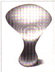
The Hoo Doo inspired floor lamp.

"We had hoped to get some of the local stores in Drumheller and had little success so far,"